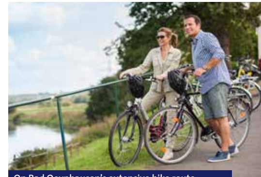
On Bad Oeynhausen's extensive bike route