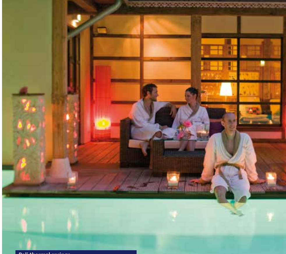
Bali thermal springs