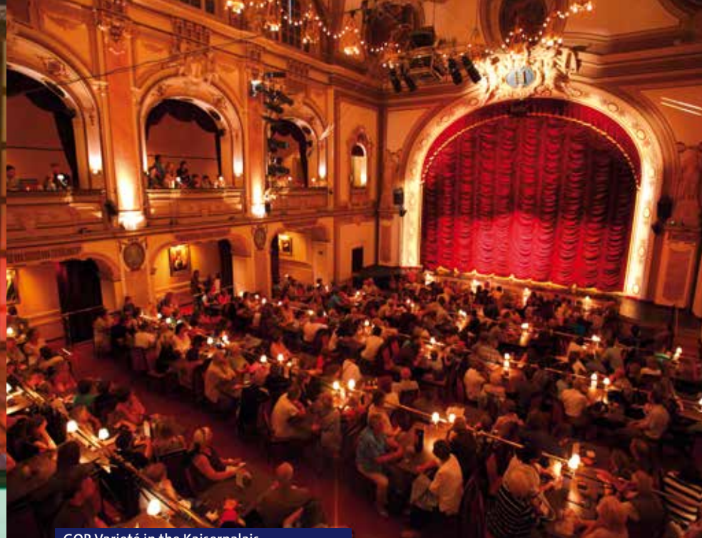
GOP Variété in the Kaiserpalais

► Showtime is Wednesday and Thursday at 8 pm, Friday and Saturday at 6 pm and 9 pm and Sunday/bank holidays at 2:30 pm and 5:30 pm. Tickets, starting at 20 Euros, are available here: