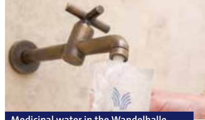
Medicinal water in the Wandelhalle

Take a big sip of the freshly tapped medicinal water from the Wittekind well and the “Thermal-Quelle” in the Wandelhalle and feel like a spa guest at the time of the emperor. It tastes of seawater and is also very healthy.