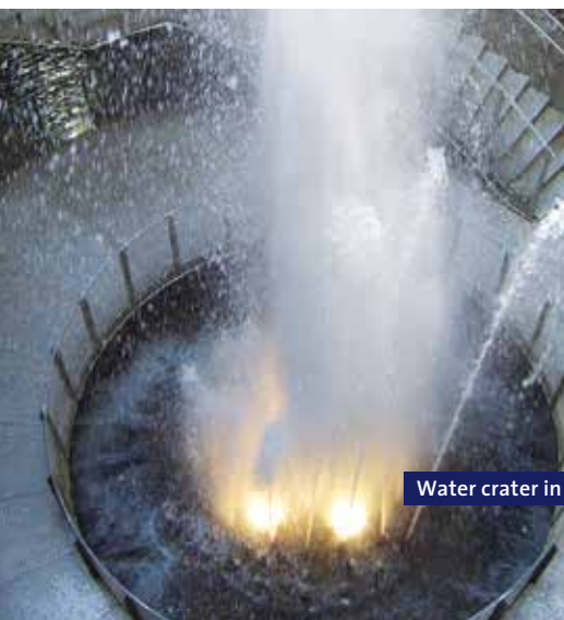
Water crater in Aqua Magica park

► The water crater is open from mid April to 3rd October on Thursday and Friday from 11 am – 6 pm (spectacle every half an hour) as well as Saturday, Sunday and on public holidays from 10 am – 7 pm (spectacle every quarter of an hour). Entrance fee: adults 2 Euros, discounted rate 1 Euro, children aged 15 and under gratis.