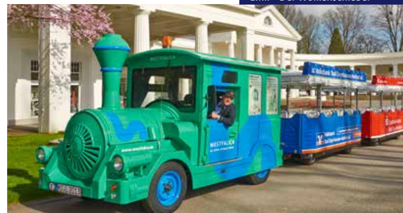
“Emil – Der Wolkenschieber”

► Tours are available daily from April to October, except on Mondays. Tickets can be purchased from the train driver, in the tourist information and in the Verkehreshaus café & wine bar at Innowroclaw-Platz. The tours start here.