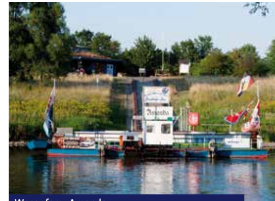
Weser ferry Amanda