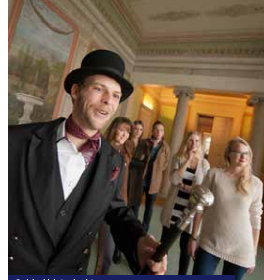
Guided historical tour

› WeserHütte, Adam-Opel-Straße 11, 32547 Bad Oeynhausen Tel. 0 57 31 / 2 54 80 08 www.weser-huette.de › Altes Fährhaus Fährweg 17, 32547 Bad Oeynhausen Tel. 0 57 31 / 3 00 59 88