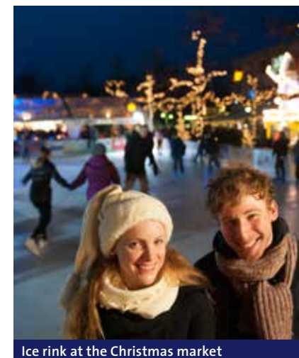
Ice rink at the Christmas market

► From the end of November until the end of December from 11 am – 9 pm, the Innowroclaw-Platz attracts winter sports lovers. Ice skates are available for hire.