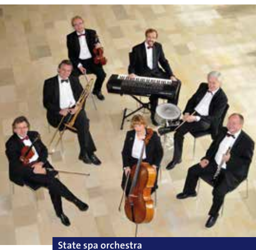
State spa orchestra

› Spa concerts (free entry): Mondays, Thursdays and Fridays: 3:30 pm Tuesdays: 10 am and 3:30 pm Saturdays: 10 am matinée and 3 pm request concert Sundays: 10:30 am matinée, 3 pm afternoon concert. 7 pm tunes to sing along to (every 1st and 3rd Sunday)