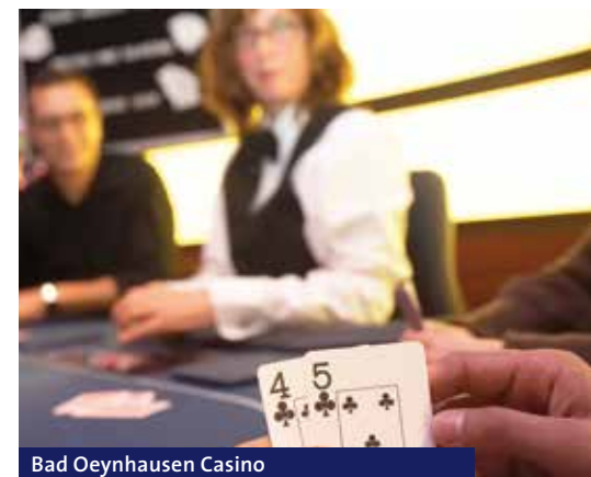
Bad Oeynhausen Casino

► Spielbank Bad Oeynhausen (casino), Mindener Straße 36, 32547 Bad Oeynhausen, www.casino-badoeynhausen.de