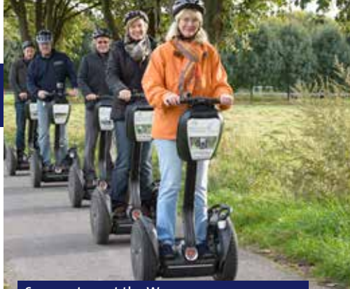
Segway tour at the Werre