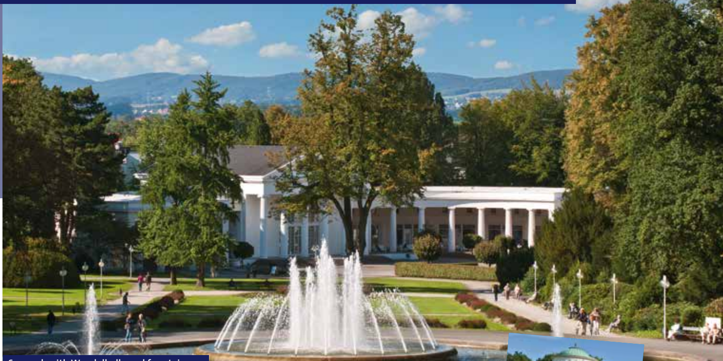
Spa park with Wandelhalle and fountain

Today, Bad Oeynhausen has responded to health sector developments and has a good reputation throughout Germany as a medical centre that offers a differentiated and complex range of