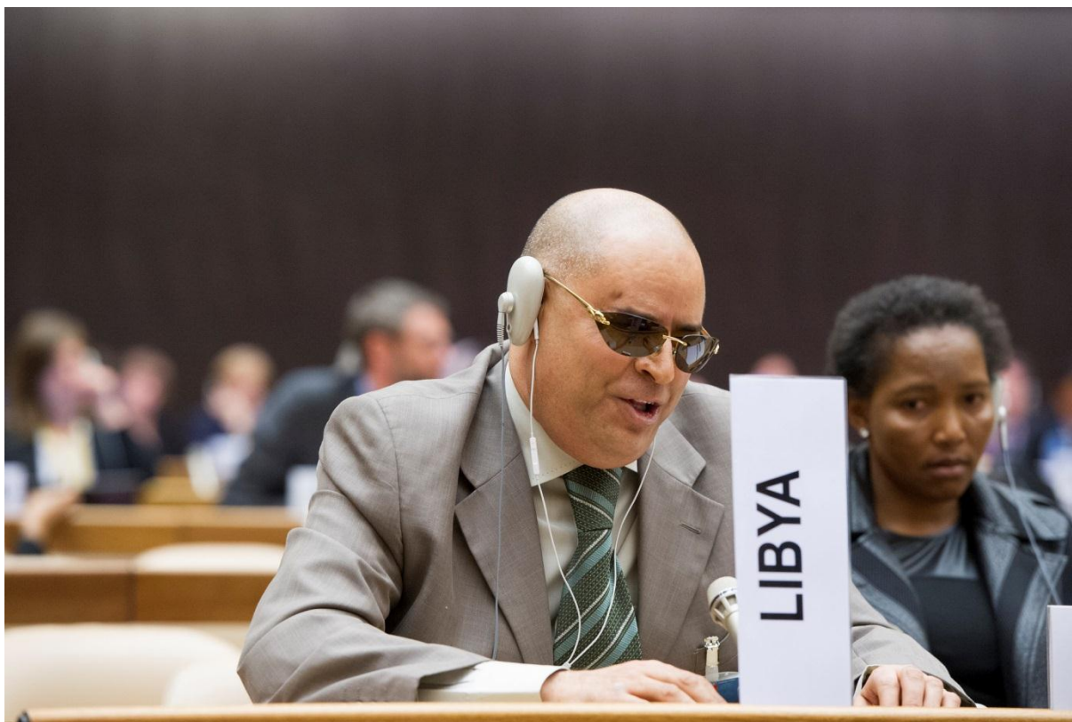
The Representative of Libya addresses during the Panel discussion on the Role of local authorities in promoting inclusion of refugees and migrants, Palais des Nations. 8 May 2017.

Restrictive policies in themselves, such as trying to keep migrants from reaching the shores of Europe, harden the image of migrants as potential economic competitors. Most of the opposition to asylum-seekers in Europe nowadays comes from those authoritarian political forces who openly advocate the exclusion of “others”, for example, right-wing populist parties.