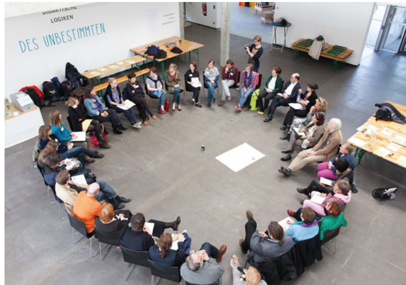
Workshop during a conference on art didactics.

The University of Fine Arts Münster has the right to award doctorates for the academic subjects represented by full-time professorships (see above). Our Ph.D programme is characterised by its intimate connection with the University's artistic and cultural activities in both research and tuition.